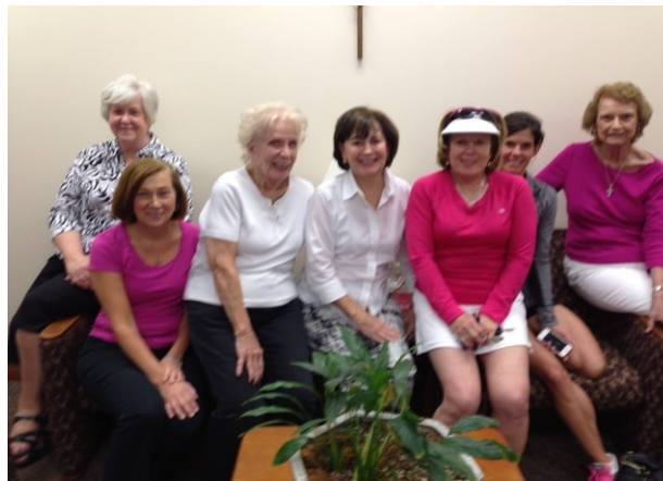
Members of the leadership team at monthly meeting .

The VC is the person who calls or emails you. This is a two-week rotating job and