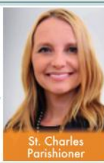
St. Charles Parishioner