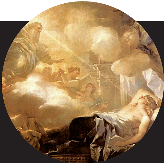
Dream of Solomon by Luca Giordano

K ing David's reign comes to an end in this week's readings. He proclaims Solomon as his successor. Solomon's reign begins with great promise. God is pleased that Solomon asks for wisdom to rule well, and he says Solomon will live a long life if he remains obedient. But despite having great wisdom, Solomon does not remain completely faithful. He takes many wives and participates with them in the worship of their false gods. But Solomon builds the Temple in Jerusalem, his greatest achievement.